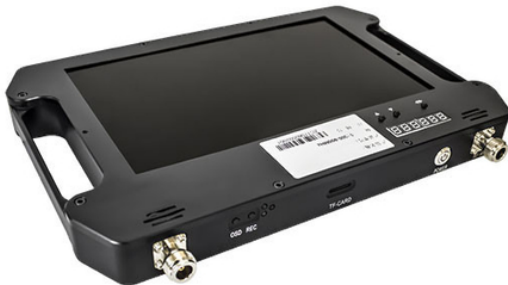
Cofdm 300MHz~2.7GHz AES256 10.1 Inches Portable Handheld Video Data Receiver